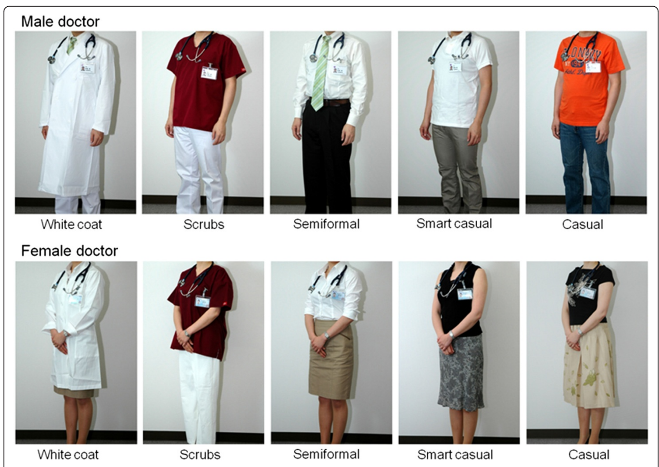
Figure 1 Photographs shown to study participants of the different clothing styles for male and female doctors. The "white coat" style consisted of a shirt, necktie and white coat for men, and a skirt and white coat for women; the scrubs consisted of dark red scrubs for both men and women; semiformal clothing consisted of a shirt and necktie for men, and a blouse and skirt for women; smart casual clothing was a white polo shirt for men, and a sleeveless blouse and skirt for women; casual clothing consisted of jeans and a T-shirt for men, and a T-shirt with skirt for women. In all photographs, the background, camera angle, posture, position of the stethoscope and name tag were kept constant, and, to avoid any effects of expression and countenance, no faces appeared in any of the photographs.

the participants into four, 15-year age-range groups: (i) <35 years of age (younger group); (ii) from 35 to 49 years of age (lower-middle group); (iii) from 50 to 64 years of age (higher-middle group); and (iv) >65 years of age (elderly group).