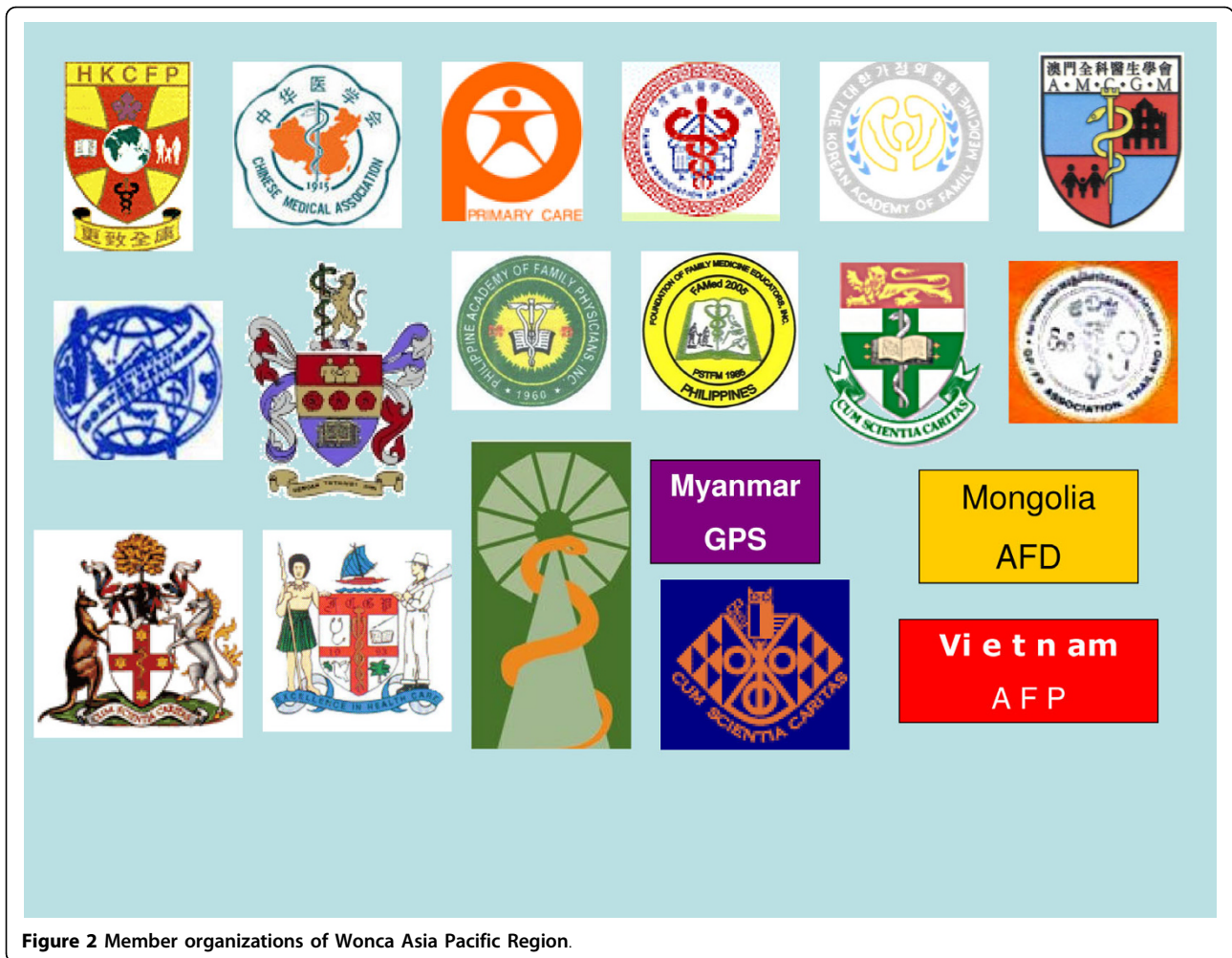
Figure 2 Member organizations of Wonca Asia Pacific Region.

core curriculum for family medicine, as well as the core content of examination. Research workshops gave way to the publication of several journals, including the Asia Pacific Family Medicine [4,5]. In addition, Wonca, both globally and regionally, has undertaken activities that guide countries in developing, strengthening, and enhancing primary care. Global activities include the 1994 Wonca - WHO strategic meeting in Canada, Global Family Doctor website, 2002 Guidebook, and 2003 Research Workshop. Among the regional activities in Asia Pacific were regional conferences, regional structure and bylaws, the struggling Asia Pacific Family Medicine journal and family medicine education workshops.