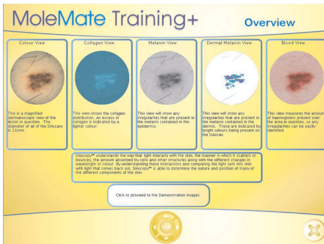
Figure 1 Overview of MoleMate™ training program showing 'Views'.

The program calculates a total score from the percentage of correct answers and the time it takes for each lesion to be assessed.